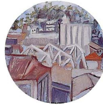
Maureen McDermott 'Richmond Landscape 1' , 1999. Oil on board 45cm