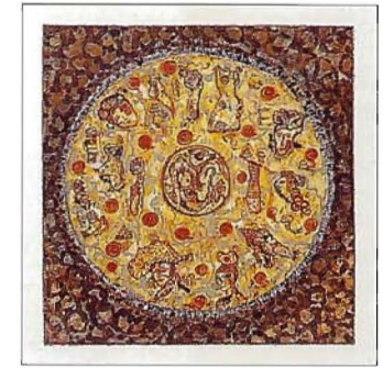
Lillian Townsend 'Sun Ritual 2' , 1999. Acrylic and ink on cotton 64 X 64cm