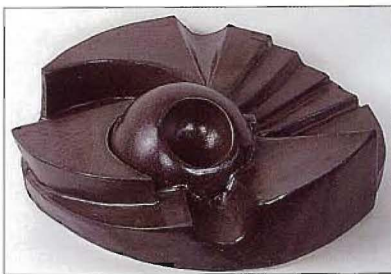
Pam Wragg 'Circular Sweep' 1999. Ceramic 45cm