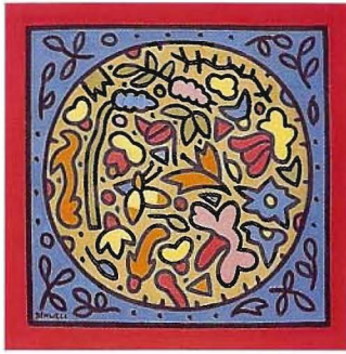
Meg Benwell 'Natural Connections' 1999. Oil on canvas 61 X 61cm.