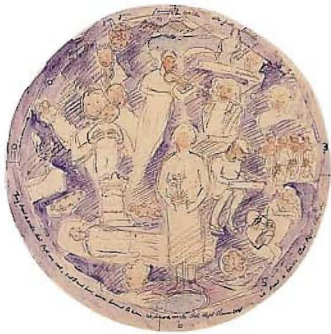
Toni Bucknell 'Love is a circle that doth restless move' 1999. Pencil and wash on paper 45cms