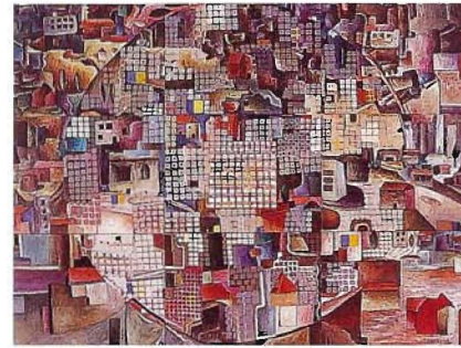
Rachel Rovay 'Whirl around the cycle' , 1999. Acrylic on canvas on nine boards 76.5 X 122.5cm.