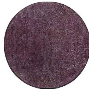
Wendy Kelly '2πr: Panel 1' , 1999. Detail. Oil and Thread on Board 45"