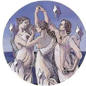
Josie Telfer 'Spiral Dance 1' 1999. Acrylic on board 45"