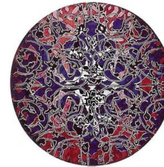
Aloma Treister 'Disc 1' , 1999. Acrylic on canvas on board 45"